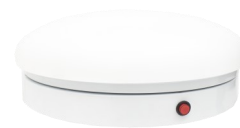
Shown with OPT-EM-FCR14